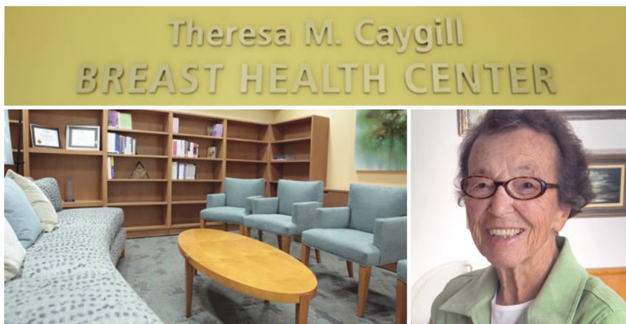
The new Theresa M. Caygill Breast Health Center opened at John Muir Medical Center, Walnut Creek in May.