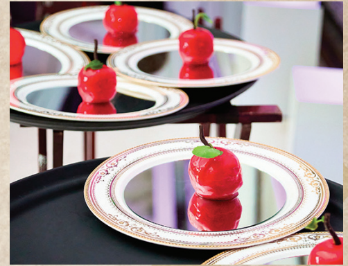
Snow White's dessert

Over the past decade, this event has collectively generated over $20 million, contributing to vital areas such as pediatric intensive care, cancer services, cardiovascular services, emergency and trauma, neurosciences, COVID-19 relief, and intensive care, in addition to the Birth Center. We express our deep gratitude for the ongoing generosity and support of our community in our endeavors, including battling cancer and ushering new life into the world.