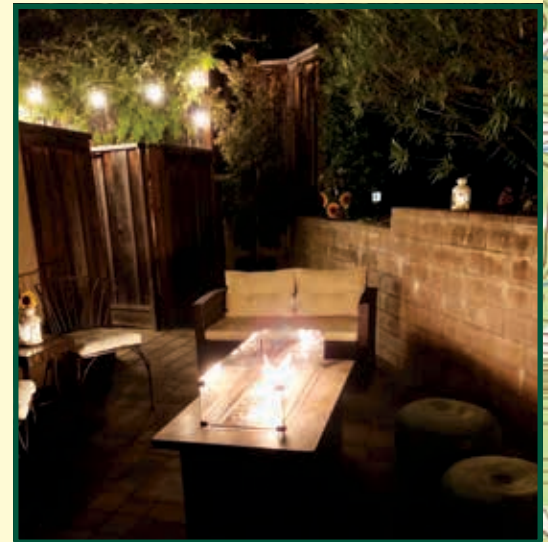
Campfire photo shared by gala participants during the event.