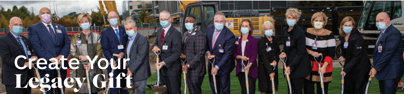
John Muir Health Leadership Team at the 2021 Cancer Pavilion groundbreaking

Charitable estate planning can be financially beneficial for families and individuals of various ages and income levels. Find out what planning a Legacy Gift to John Muir Health can do for you and your loved ones—now and in the future.