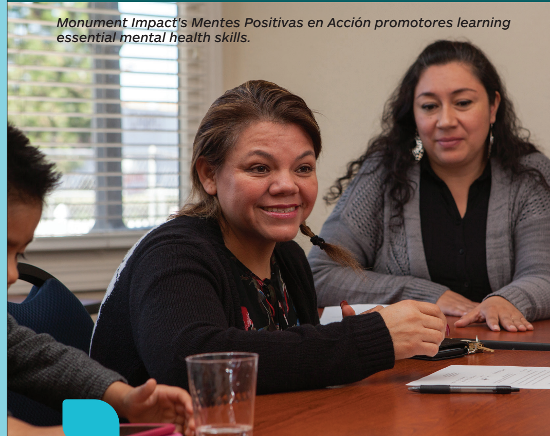
Monument Impact's Mentas Positivas en Acción promotores learning essential mental health skills.

23 WORKSHOPS AND SUPPORT GROUPS HOSTED by partners, engaging 227 total participants