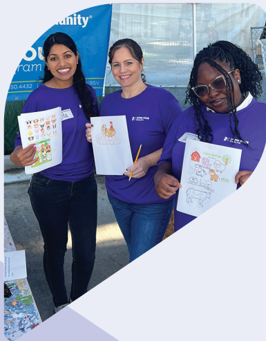
John Muir Health staff volunteer with Habitat for Humanity.