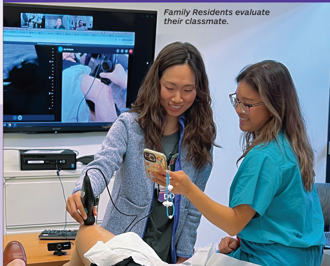
Family Residents evaluate their classmate.

across more than a dozen health professions