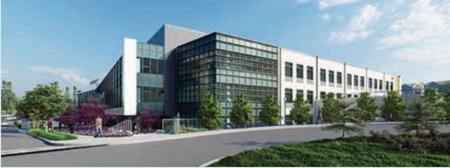
The Cancer Pavilion at John Muir Health