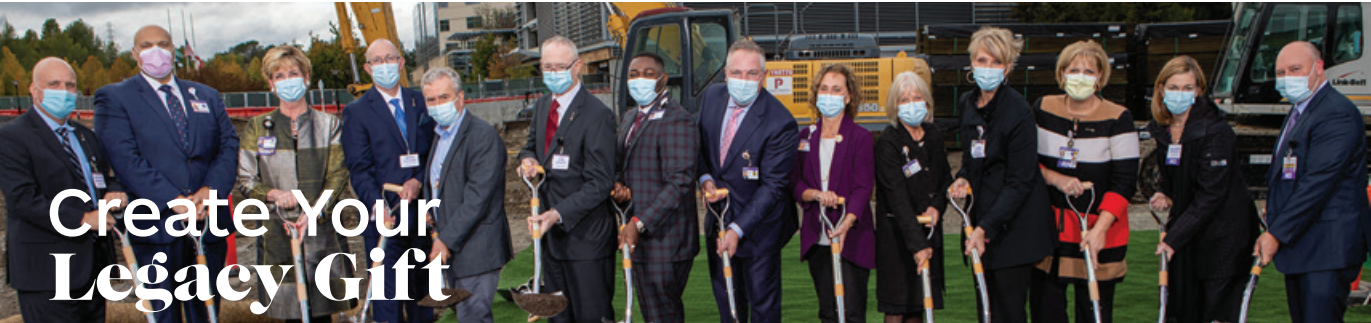
John Muir Health Leadership Team at the 2021 Cancer Pavilion groundbreaking

Charitable estate planning can be financially beneficial for families and individuals of various ages and income levels. Find out what planning a Legacy Gift to John Muir Health can do for you and your loved ones—now and in the future.